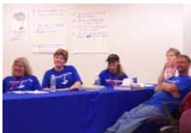
Playground Safety School Students enjoying the playground safety message.