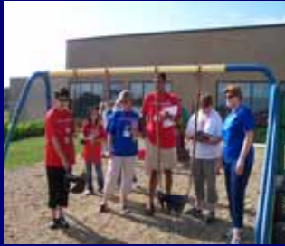
Safety school participants examine play equipment at a local child care center.

Playground Safety School is 3 1/2 fun-filled days of learning everything you wanted to know about playground safety, including: