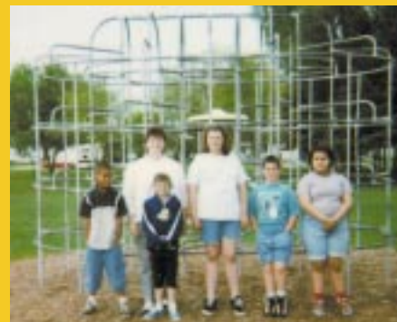
Members of the Do-Something League helped get these unsafe monkey bars removed from their playground

Even before learning of NPPS, the students had their mission in place. They designed and distributed a survey to their classmates about favorite and least favorite equipment, playground overcrowding, surfacing and the safety of the equipment. Upon tabulating the results, they made proposals which caught the attention of the PTO, the principal