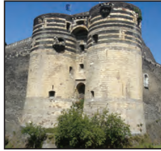
View of the majestic Chateau d'Angers, which overlooks the city and the Maine River

If you wish, we would be happy to send you a list of recent participants who have authorized us to release their names to potential participants.