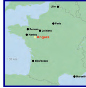
Angers is 300 km southwest of Paris, and 90 km east of the Atlantic Ocean