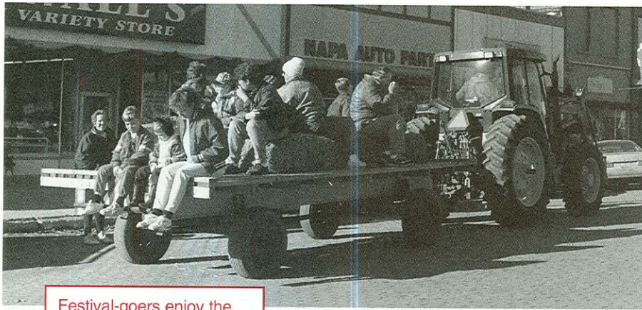
Festival-goers enjoy the Weihnachtsfest hayride in Manning at Christmas.

are revitalizing German life and culture.