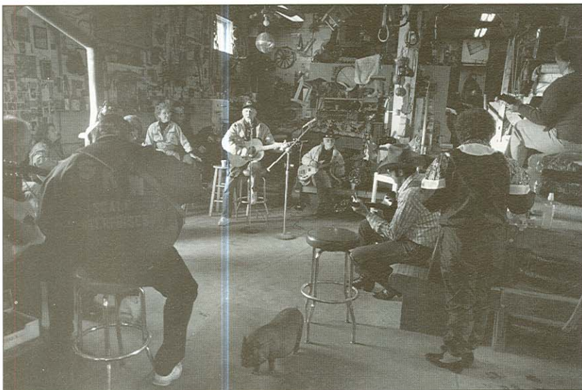
CONTEXT (OR SET) SHOT