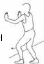
Standing soleus stretch

3. Standing Soleus Stretch: Stand facing a wall with your hands at about chest level. With both knees slightly bent and the injured foot back, gently lean into the wall until you feel a stretch in your lower calf. Once again, angle the toes of you injured foot slightly inward and keep your heel down on the floor. Hold this for 30 seconds. Return to the starting position. Repeat 3 times.