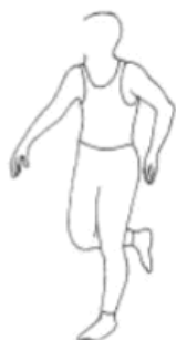
Single leg balance

8. Single leg balance: Stand without any support and attempt to balance on Your injured leg. Behind with your eyes open and then try to perform the exercise with your eyes closed. Hold the single-leg position for 30 seconds. Repeat 3 times.