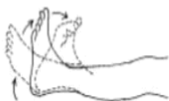
Ankle range of motion

4. Ankle range of motion: You can do this exercise sitting or lying down. Pretend you are writing each of the letters of the alphabet with your foot. This will move your ankle in all directions. Do this twice.