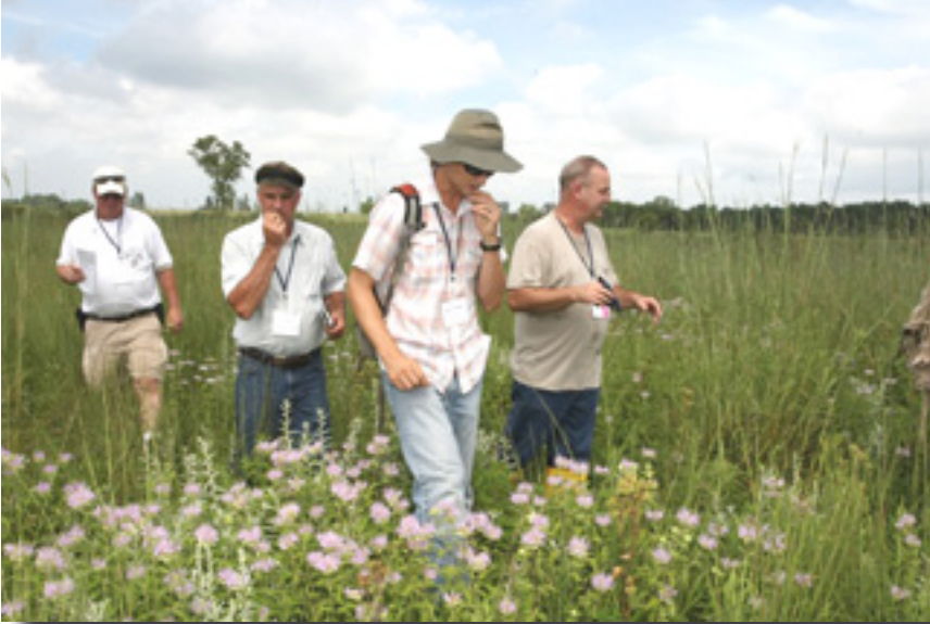
NAPC Cedar Hills Field Trip