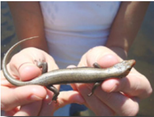
Broad-headed skink ( Plestiodon fasciatus ) found in Sleepy Creek Wildlife Management Area on May 20.