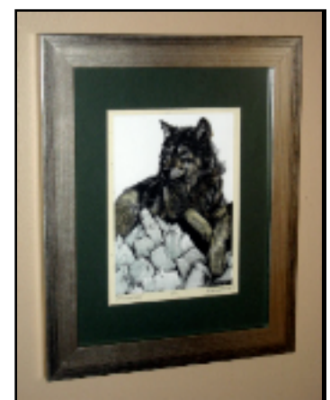
First in a series of ten hand-colored photo reproductions from an original 5" x 7" scratchboard drawing. Presented in an 8 1/2" x 11" brushed silver frame. Minimum - $30.00