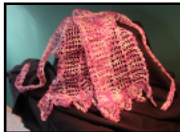
Hand crocheted, lavender fancy apron - Minimum $15.00