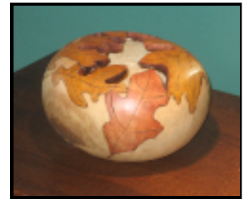
Hand crafted and painted gourd bowl with leaves, approximately 8" diameter. Minimum $20.00