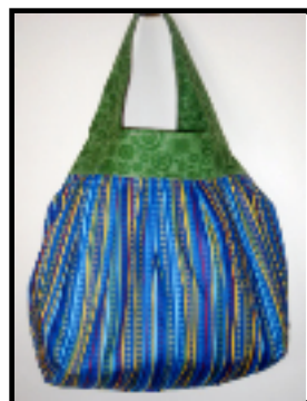
Hand constructed blue striped bag with inside pockets, approximately 18 x 20" + handle Minimum- $45.00